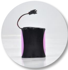
Built-in LI-ION battery (11.1V 2.6A) for over 28 hours of operation

Max output of 16 watts with 3-inch Class D driven NEODYMIUM speaker